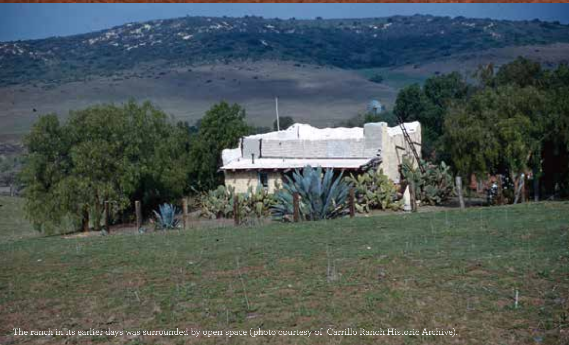
The ranch in its earlier days was surrounded by open space (photo courtesy of Carrillo Ranch Historic Archive).